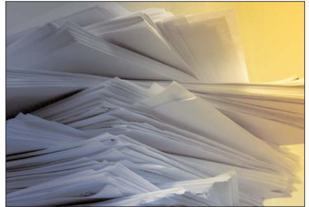
Paper paper paper.. cost cost cost!